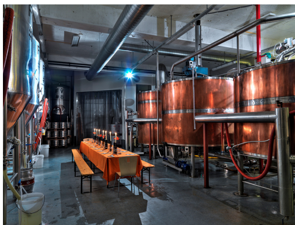
At the local brewery Nøgne Ø

Credit cards (MasterCard / VISA / Diners) are widely accepted.