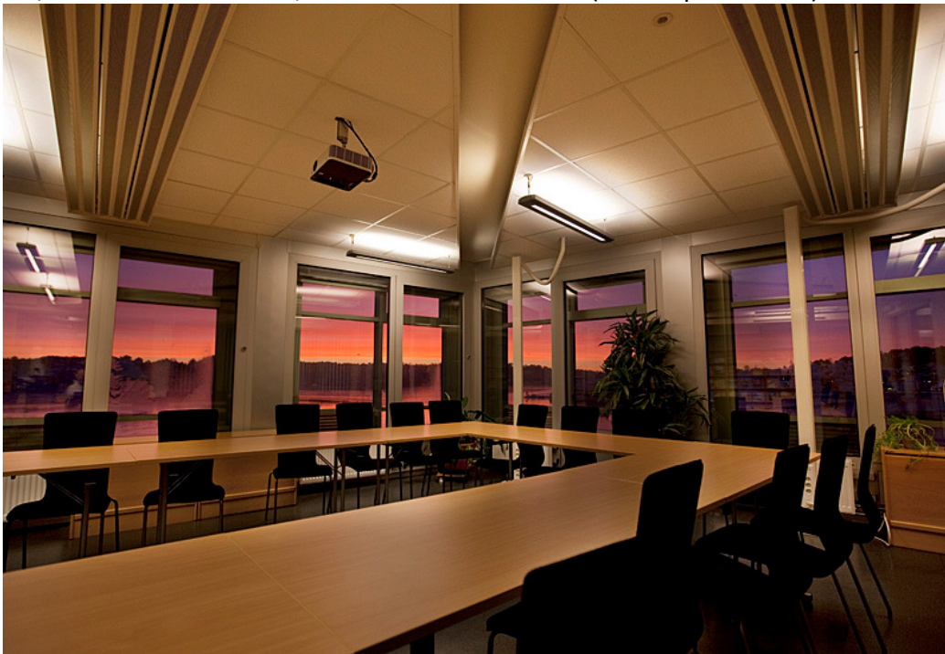
UNEP/GRID-Arendal meeting room

UNEP/GRID-Arendal offices, inside of the UN House (see map attached)